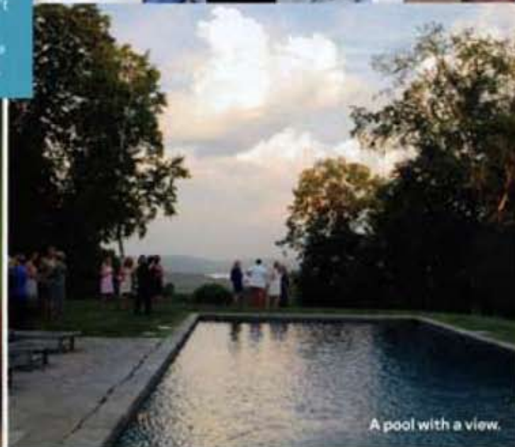
A pool with a view.